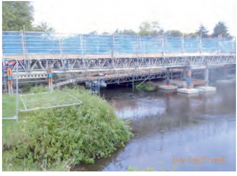
Carriageway Removal and Stone Removal