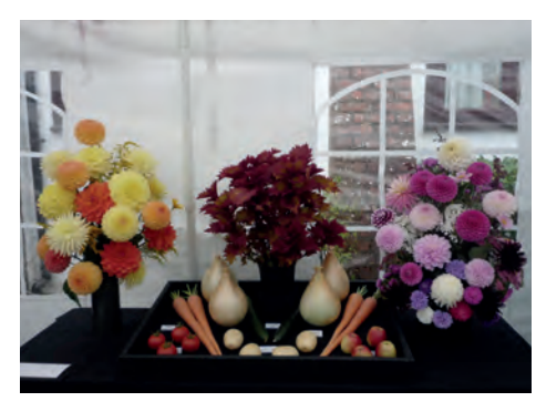
Garden Hints for November/ December.

Subscriptions are still £6 single or £10 for a whole family – the New Year starts with the Chairman's Evening on Wednesday, 5th February. For further details, phone above number or please email: info@tilfordgardeningclub.co.uk