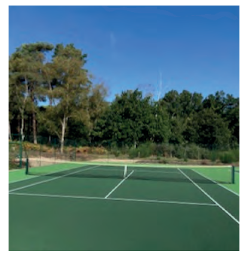
Reasons to Become a Member of Tilford & Rushmoor Tennis Club

We hope all our members have been making the most of our fantastic courts over the summer months. You will have noticed that the courts are now looking particularly smart having been pressure washed and repainted.