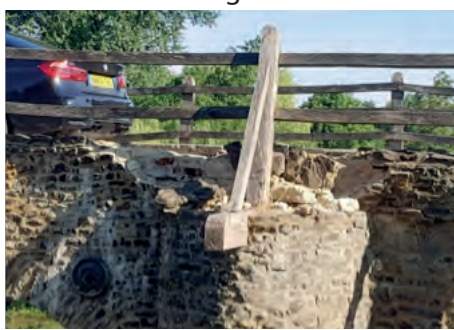
Rotted damaged timber